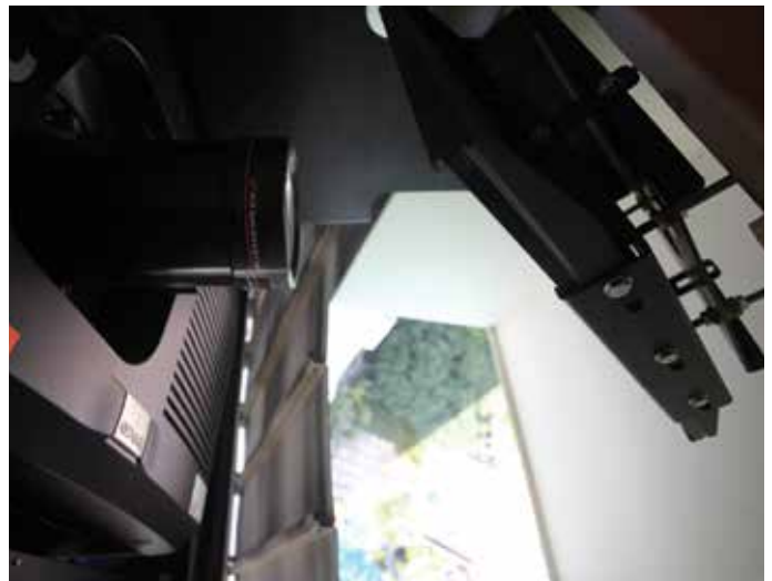
A look at the small mirror from inside the metal rooftop hut.