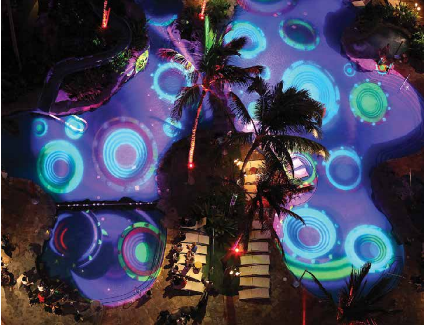
Image captured from the video.