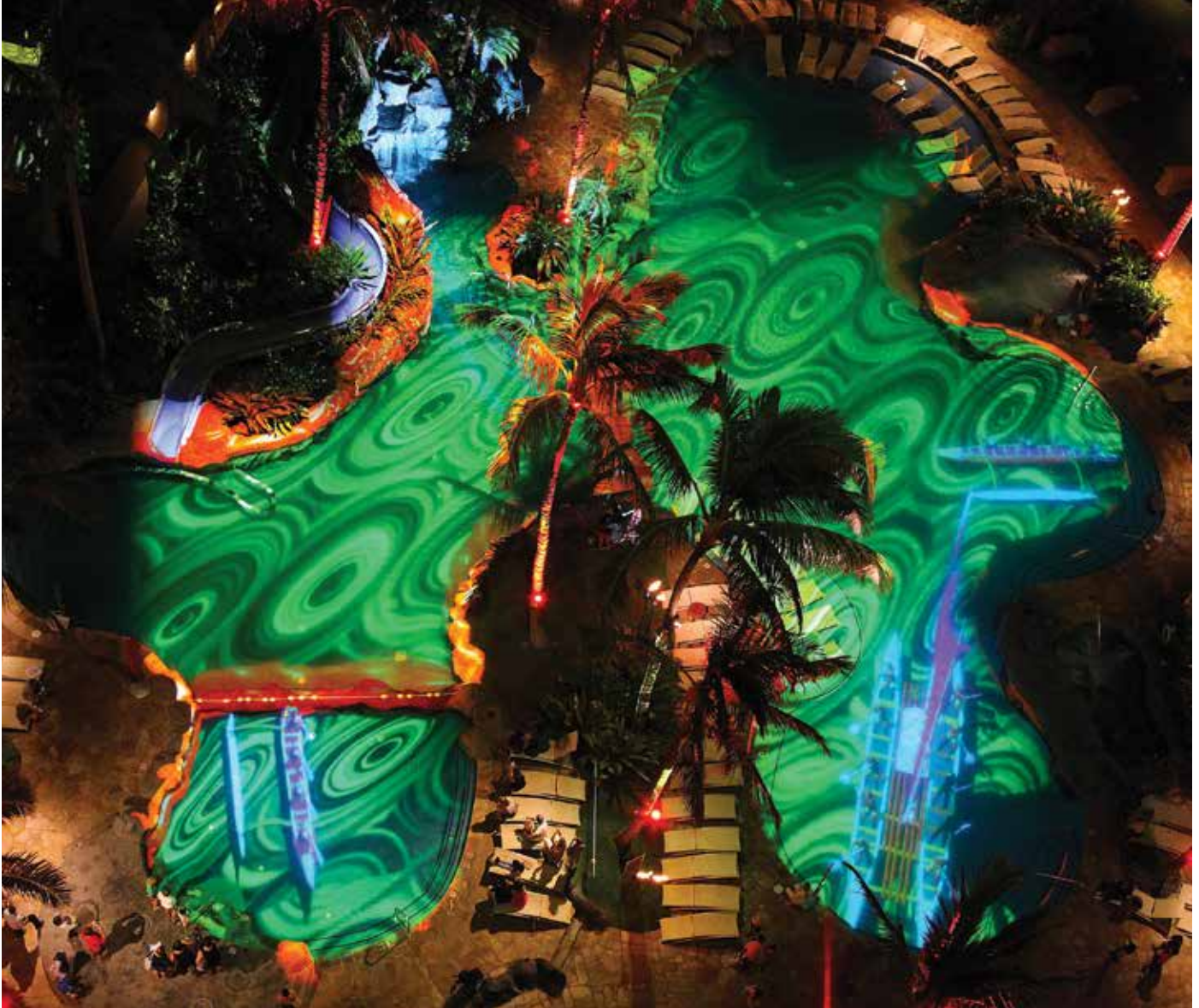
The 4D projection had to be visible in both the vertical and horizontal planes. Five Barco projectors supported by custom Draper projector structures deliver the content onto the pool.