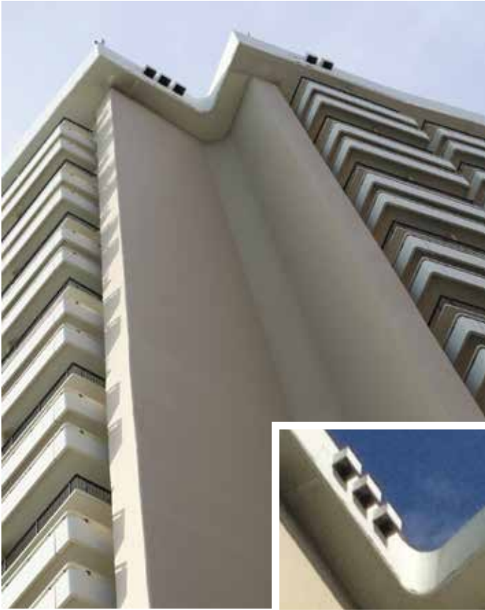
The mirrors protruding through holes in the parapet roof wall are protected from the elements using metal hoods, which also helps keep them as unobtrusive as possible.

Hattingh approached Wagner to work on projectors and support structure needs. To get the desired effect, five Barco HDQ 2k40 and two Barco HDX-W20 projectors were to be used. But, where to deploy them, and how? The pool is part of a large outside area, with no overhanging structures on which to mount and hide projectors. He had to figure out where to put the projectors, and likely have custom mounting structures designed and built—all within 45 days.