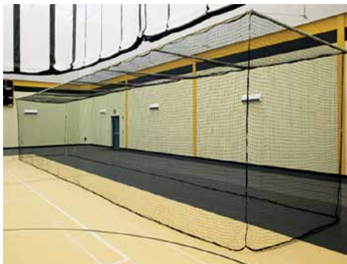
Center-Lifting Practice Cage