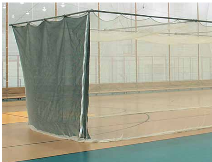
Side-Lifting Practice Cage