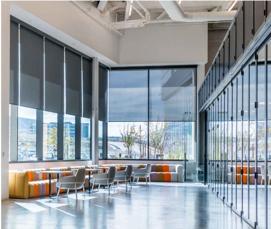
Pluralsight Corporate Headquarters, Draper, Utah. Dealer: Right Touch Installations.

DRIVE MULTIPLE ANGLED WINDOW SHADES WITH A SINGLE MOTOR