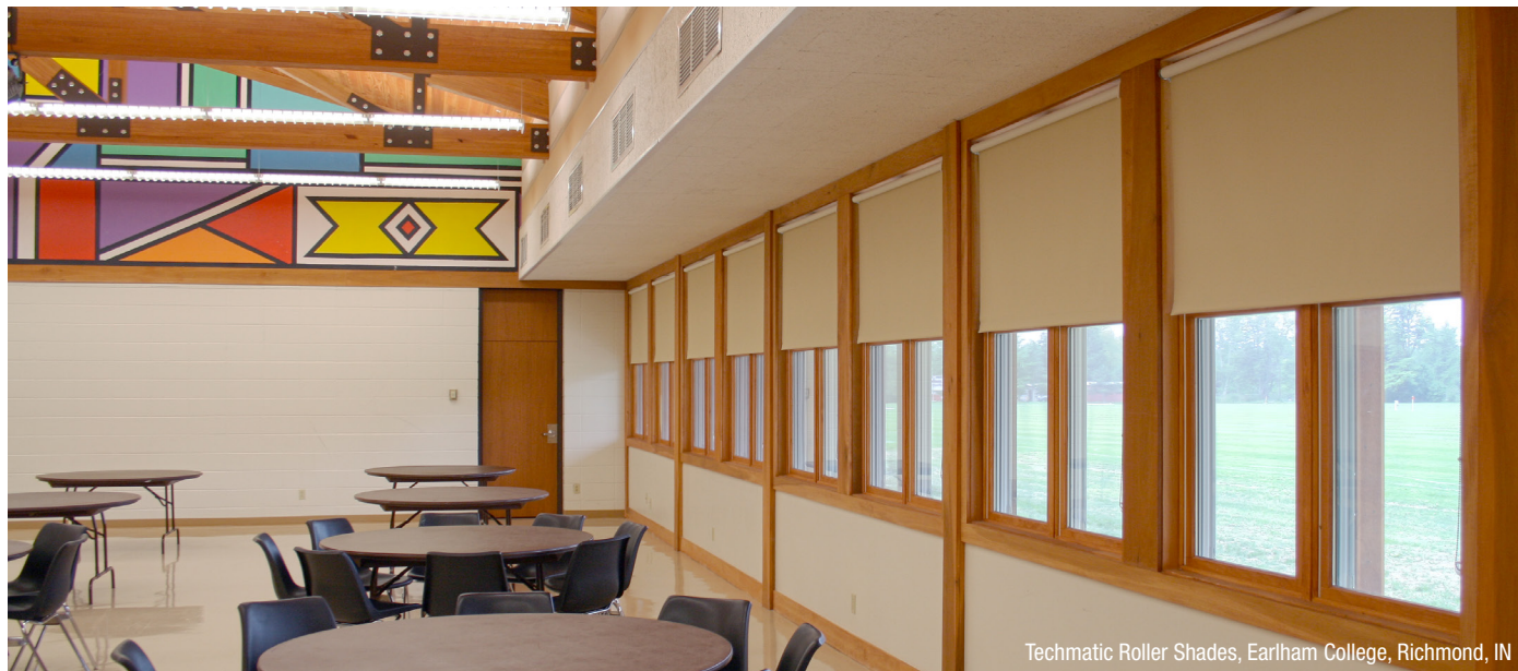
Techmatic Roller Shades, Earlham College, Richmond, IN

AFFORDABLE OPTION FOR SMALLER WINDOW APPLICATIONS