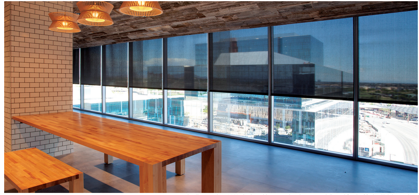
In all, more than 8600 shades with custom brackets were delivered for the Marina Heights project. Dealer: Progressive Commercial Interiors, LLC. Tempe, Arizona. Architect: Ryan Companies, Inc., Minneapolis, Minnesota.