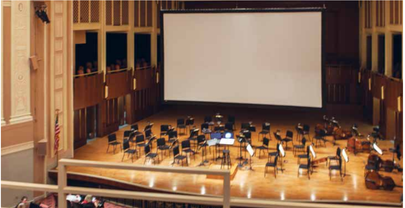
The StageScreen® takes center stage at the Hilbert Circle Theater in downtown Indianapolis for a showing of Alfred Hitchcock's "Psycho," with the soundtrack performed live by the Indianapolis Symphony Orchestra.