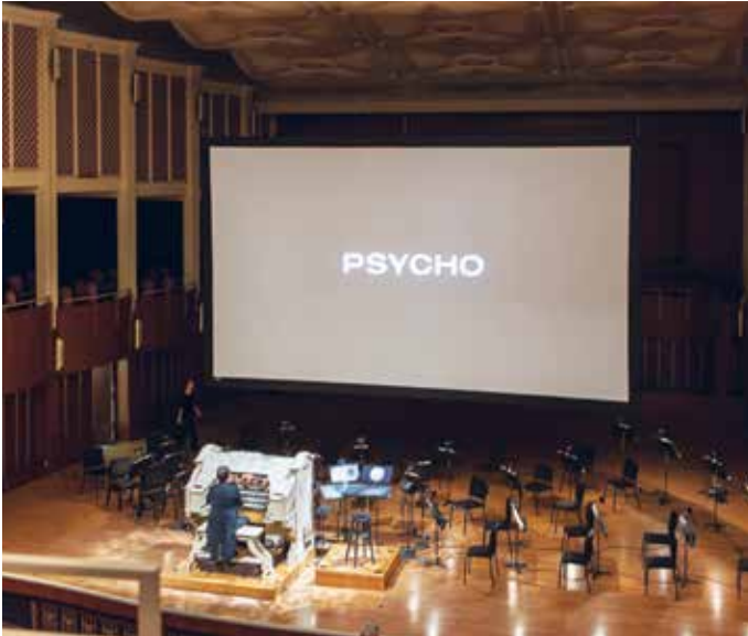
A pipe organ recital warms up the crowd just before the movie.