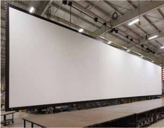
One of two 120 foot wide StageScreens® before being shipped out to Detroit.