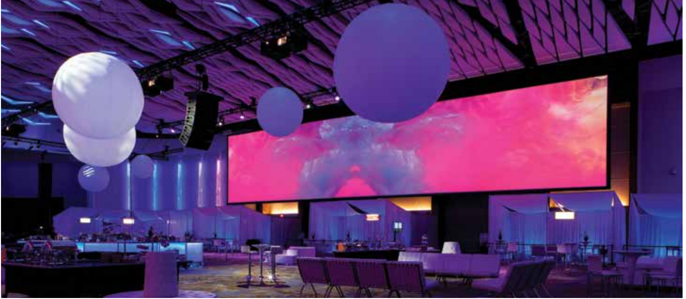
Draper's StageScreen® set and ready for the Charity Preview.