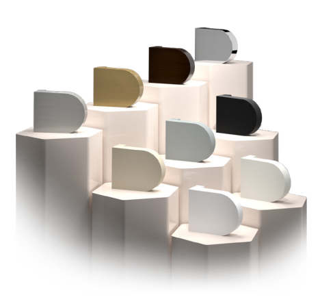
Bracket color options.

FlexStyle® Cassette is also available: in designer finishes or fabric-wrapped.