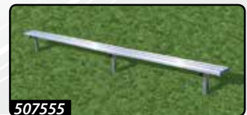
(Above) Permanent Player Bench (Below) Portable Player Bench